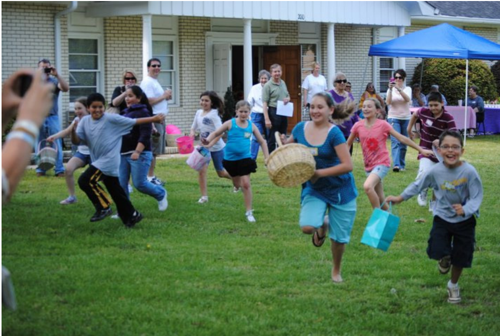
Get Ready, Get Set, GO!