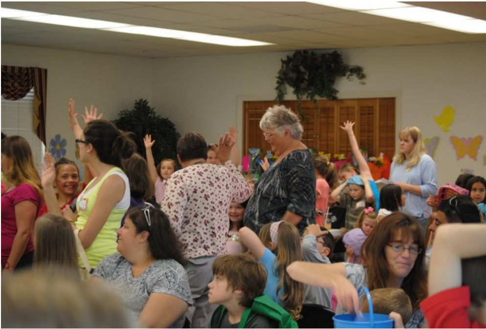
Eager Participants at the Easter Egg Hunt